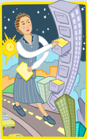
The road to a shared student information system

“ ...this was only the beginning of what has now become a whole culture of sharing among districts...”